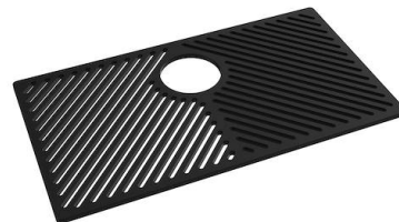
Griglia Black 8100 653