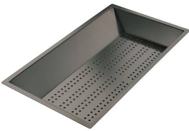
Stainless steel perforated tray PVD Gun Metal